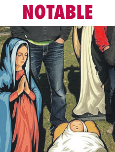
WEST POINT has even more Christmas decoration now than last year. Check it out! See Page 12.