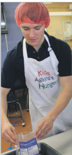
HTC TACKLES HUNGER National Honor Society students at Holy Trinity take part in Kids Against Hunger – packaging more than 3,000 meals that will be sent to towns in the U.S. as well as to other countries.